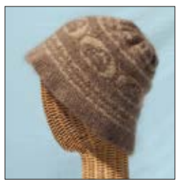
Herders Cap – bell shaped with floppy brim.