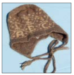
ABC Baby Cap – with ear flaps and under chin tie.