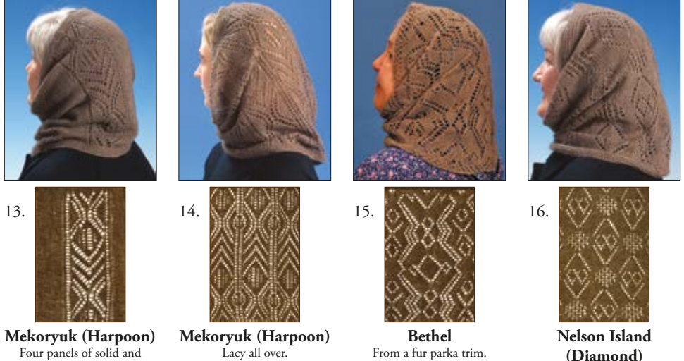
From the trim on a fur parka.